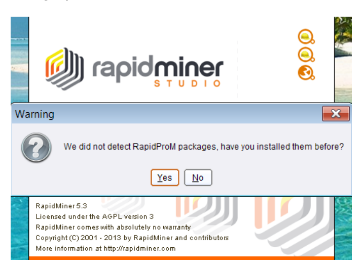
Figure 3: Initial setup wizard

Using the setup wizard is the easiest way to make the initial setup of RapidProM. Once you have correctly installed RapidProM (either manually or using the marketplace) and start RapidMiner, the setup wizard will appear as a popup asking if the packages have been installed before (shown in Fig. 3).